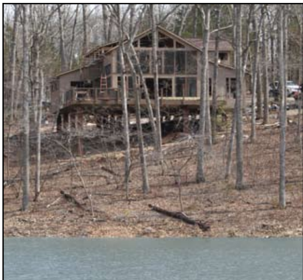
View from the water of the display being built at 1724 Sonnenalp Ridge.