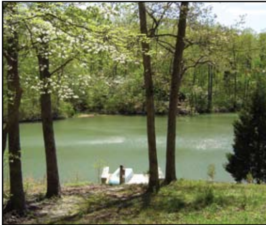
Springtime at Innsbrook provides breathtaking views.