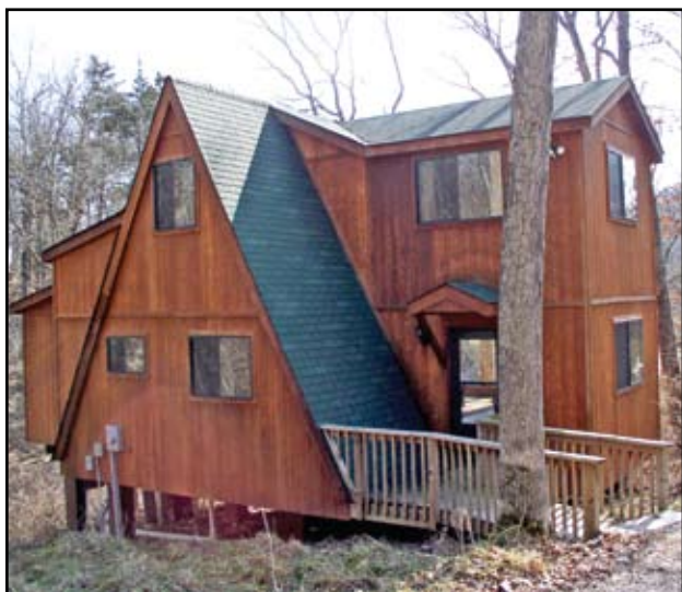
This photo represents a similar model to the display being built at 1725 Sonnenalp Ridge.

Special builder upgrades include a covered front porch, architectural shingles, large deck with aluminum spindle rails and 12'x12' dock. All outdoor deck areas are made of recycled composite material that is low-maintenance. $414,965